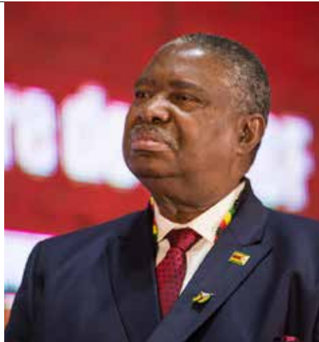
Above: Zimbabwean Vice President Phelekezela Mphoko at the official opening

Thus, when VP Mphoko finally came to the podium, the audience had been primed enough for his words. He praised the ACBF for the good work done in the last 25 years, saying "25 years ago, wherever one looked in Africa, the state of capacity had been very alarming. [But] while admitting that a lot still needs to be done, the picture is quite different